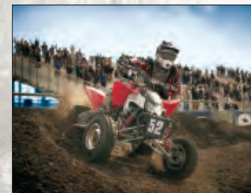
TRACK 450 MXR