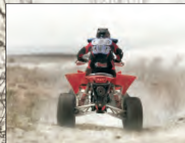
TRAIL 525 IRS