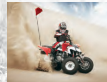
DUNES 525 S